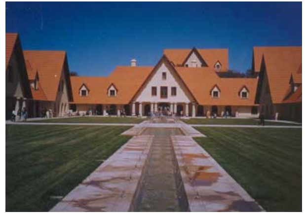
Al Akhawayn University Ifrane

During the workshop the preliminary results of GO-EuroMed 2nd stage research were discussed. The consortium also worked on further developing the project's overall message, tailoring all working papers within the political economy approach. Finally, the consortium also worked on its strategy for disseminating its results, planning PALMs and conferences for the remainder of the project. All partners agreed on strengthening communication with the national delegations of the European Union in their countries. The workshop concluded with a visit to the ancient city of Fes.